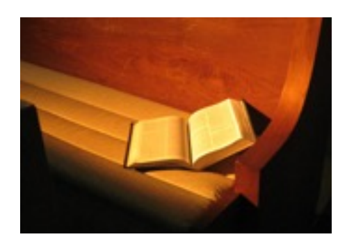
The Word of God is fundamental to leading a good church service